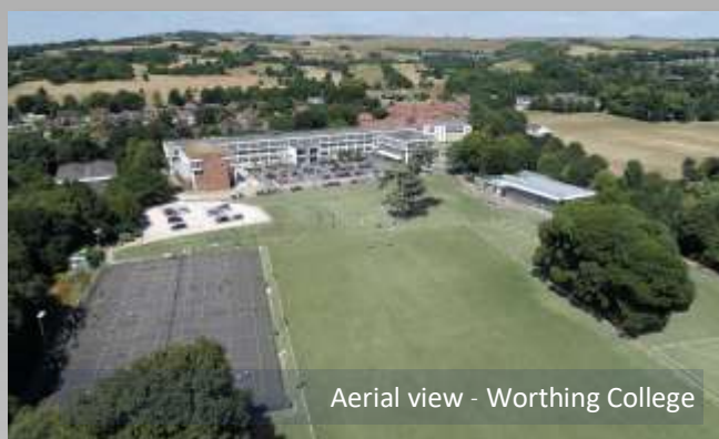
Aerial view - Worthing College