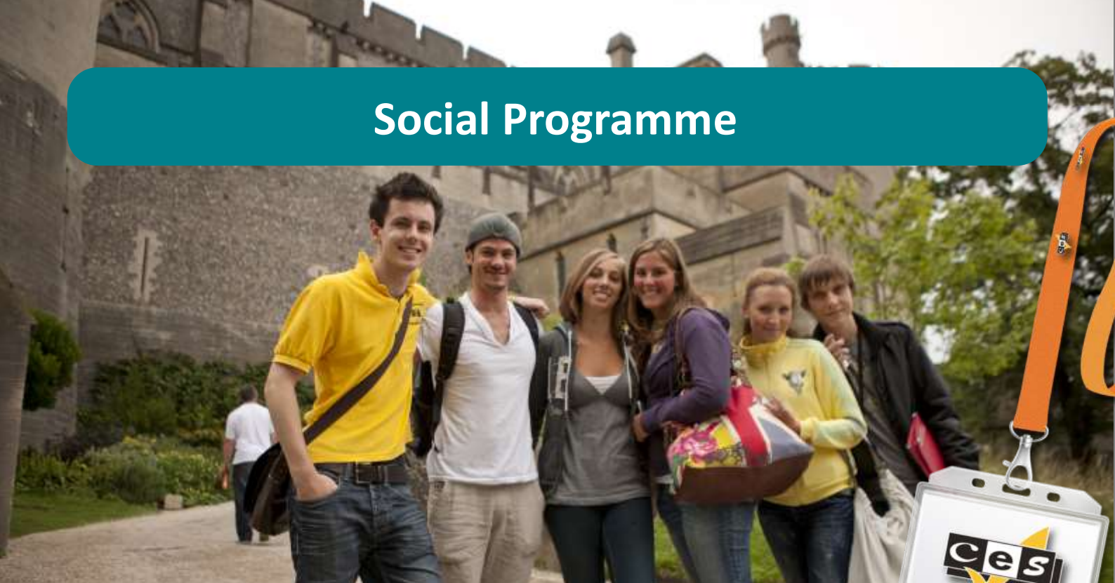
SAMPLE ENGLISH LANGUAGE AND ACTIVITY PROGRAMME